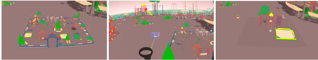
Figure 1: The original view of the WIM is set to the overall virtual environment as shown in the figure on the left. The center figure shows the user selecting a nearby tiny playset as the new view of the miniature model. The right figure shows an updated view of the WIM in which the user has successfully selected the tiny playset from the virtual space and scaled it up to make interactions more convenient.

Evan Suma Rosenberg‡ University of Minnesota